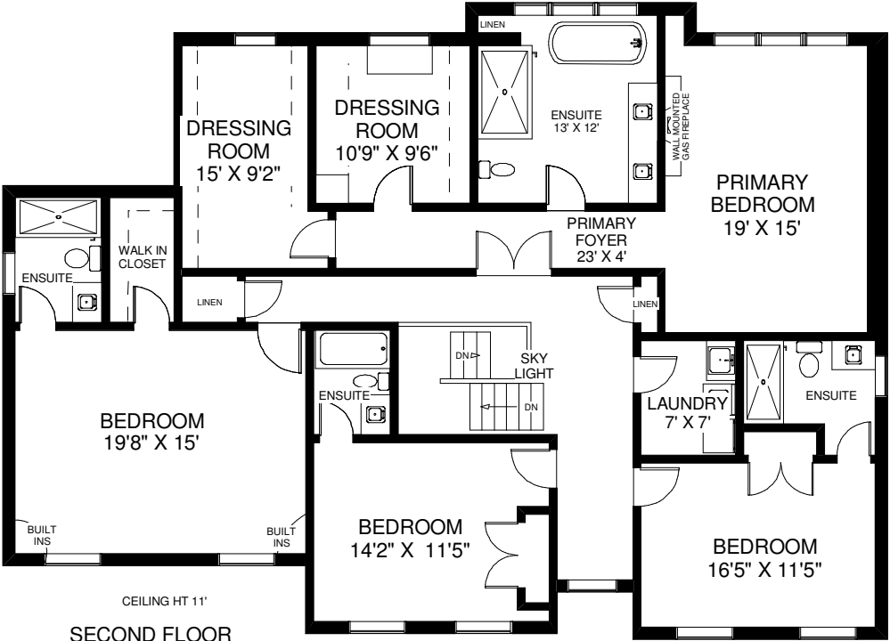
SECOND FLOOR APPROXIMATELY 2,325 SQ FT

Note: Measurements & Calculations are approximate. Provided as a guideline only.