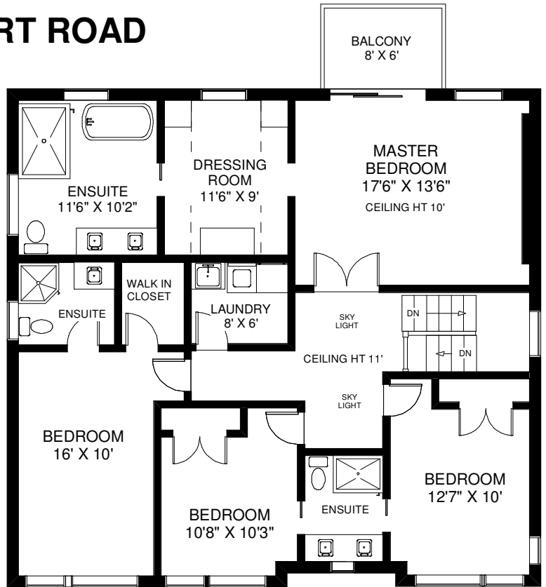
SECOND FLOOR APPROXIMATELY 1,450 SQ FT